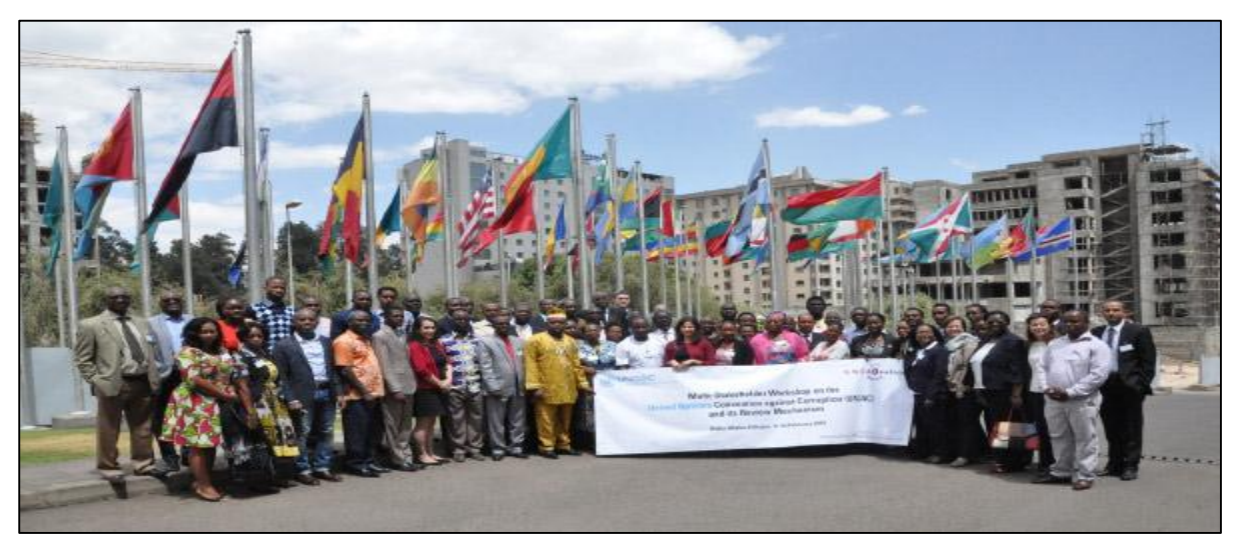
Participants at the UNCAC workshop, February 2015, Addis Ababa, Ethiopia

Following the adoption of the <u>UNCAC Review Mechanism</u> in 2010, it became immediately apparent that government representatives would require training to support its implementation.